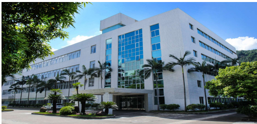
Zhongshan Weiqiang Technology Co., Ltd.