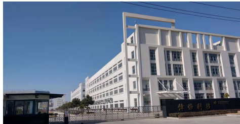
Yexian Weiqiang Technology Co., Ltd.